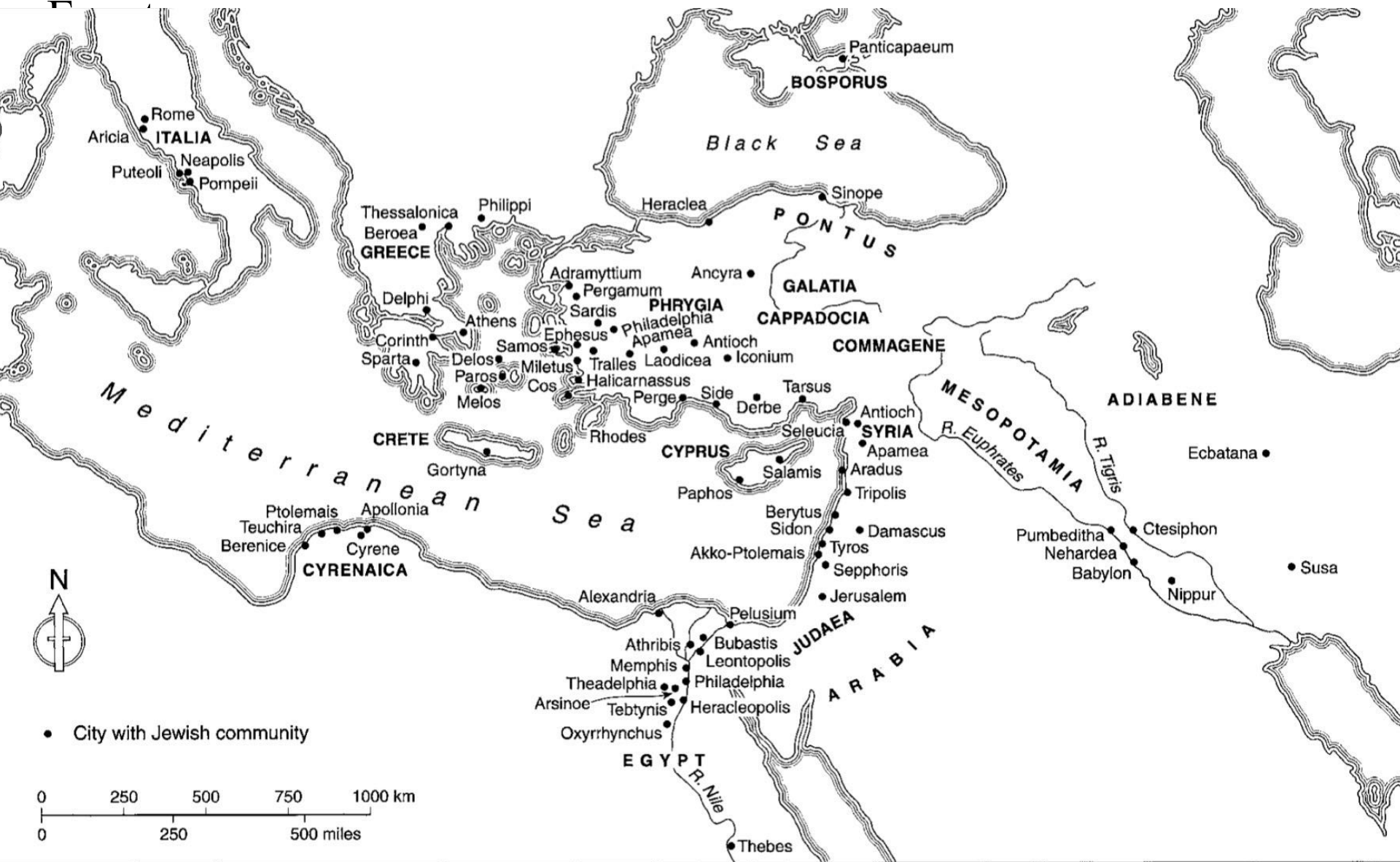
Map 3. Centres of Jewish population in the Herodian period