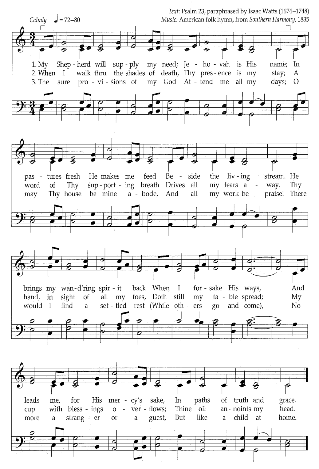
© 2015 by Intellectual Reserve, Inc. All rights reserved. This song may be copied for incidental, noncommercial church or home use. This notice must be included on each copy made.